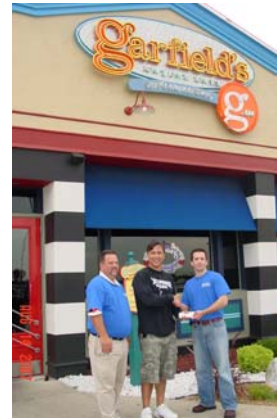
Staff participated in the Workers on Wheels fundraiser at Garfield's

140 community members participate in a Yellow Ribbon Suicide Prevention Gatekeeper training at Vo-Tech