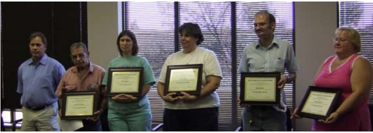
Seven individuals were trained as Peer Support Specialists.